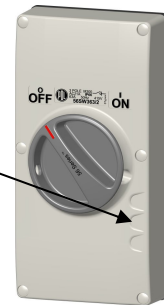
56LEDK3 & 56SW3632GY showing where LED's are to be fitted